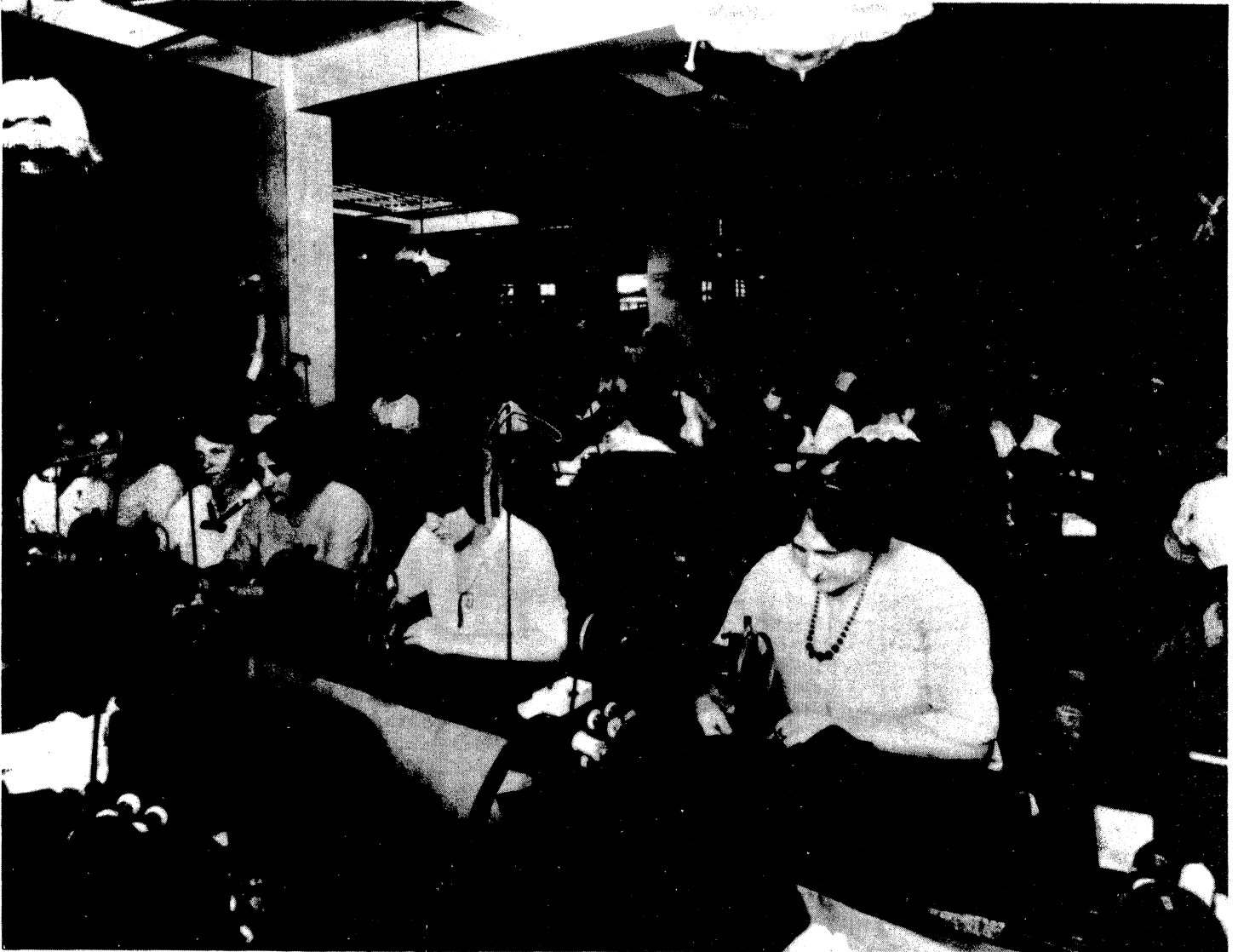
George Eastman House.

Source: Clothing Factory, New York, 1915.