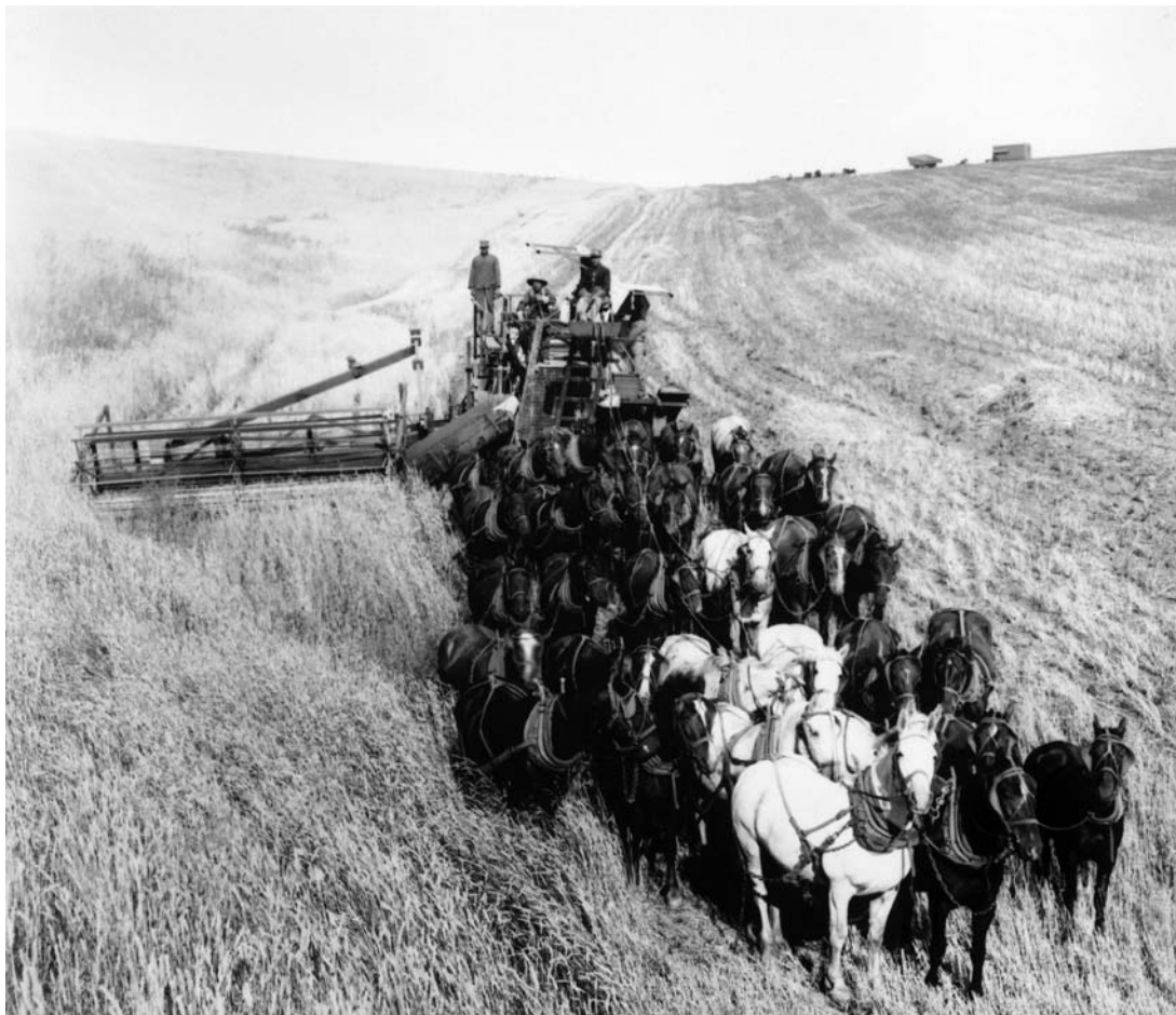
The Wheat Harvest, 1880