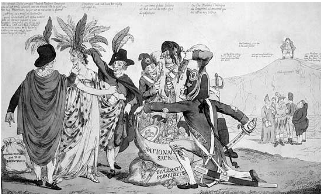
British engraving satirizing Franco-American relations after the XYZ Affair. Frenchmen plunder female "America," while five figures (lower right) representing other European countries look on.