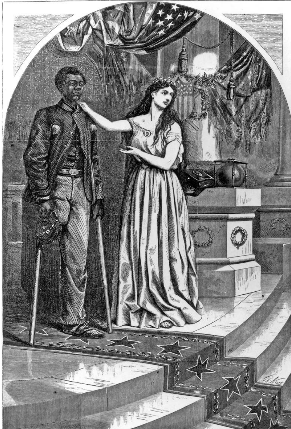
“And Not This Man?”

Source: Thomas Nast, Harper's Weekly , August 5, 1865.